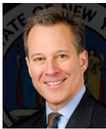
Attorney General Eric T. Schneiderman

Face scrubs, body washes, even some toothpastes include tiny plastic microbeads that enter the wastewater stream and end up in our lakes and streams. My office's Environmental Protection Bureau is working to ban microbeads from personal care products.